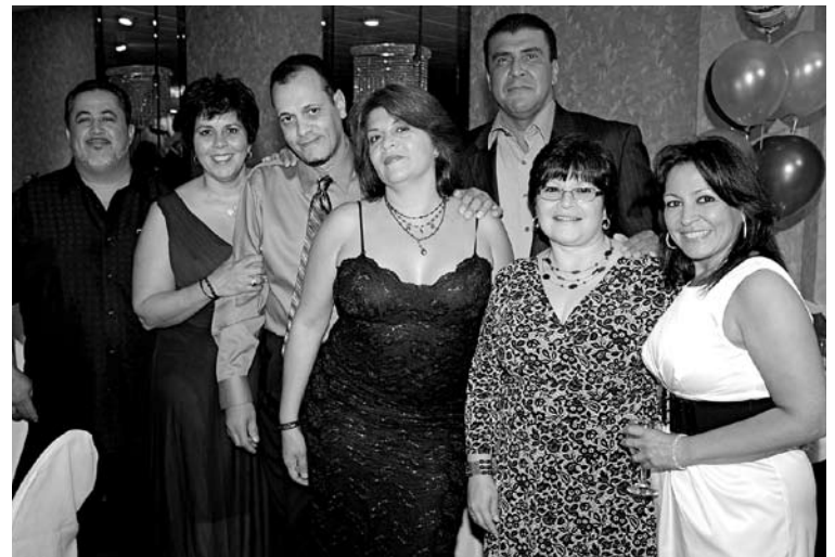
100 th Anniversary evening event at The Eastwood Manor, Bronx, NY.