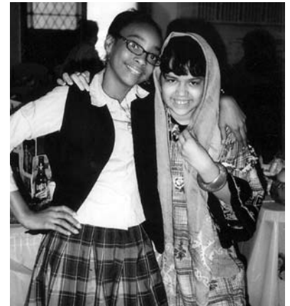
Students had a blast proudly showing off their individual heritages at St. Luke's Culture Day.